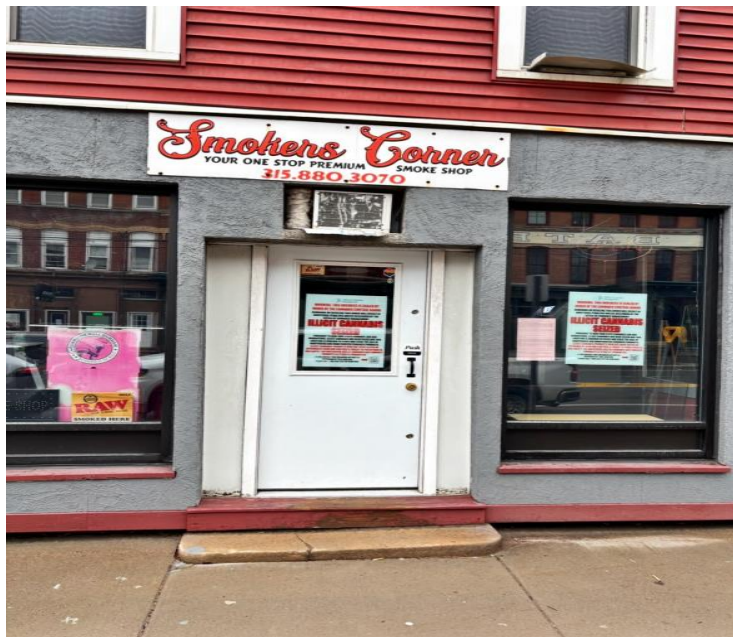
Order to Seal issued to the now padlocked Smokers Corner – 7565 S. State Street, Lowville, NY 13367

Enforcement Action Targets Illegal Sales of THC Products to Youth, Protecting Families and Local Communities